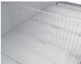
WIRE TRAY & PRODUCT DIVIDER